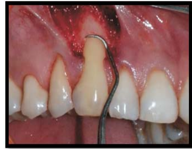
Figure 1(c): Root planning done