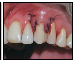
Figure 2(g): Coronal advancement of the flap and secured with sutures.