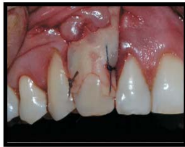
Figure 1(e): Collagen membrane secured with sutures