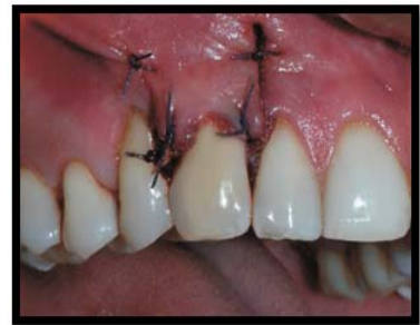
Figure 1(f): Coronal advancement of the flap and secured with sutures.