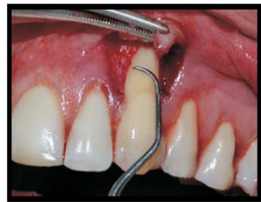
Figure 2(c): Root planing done