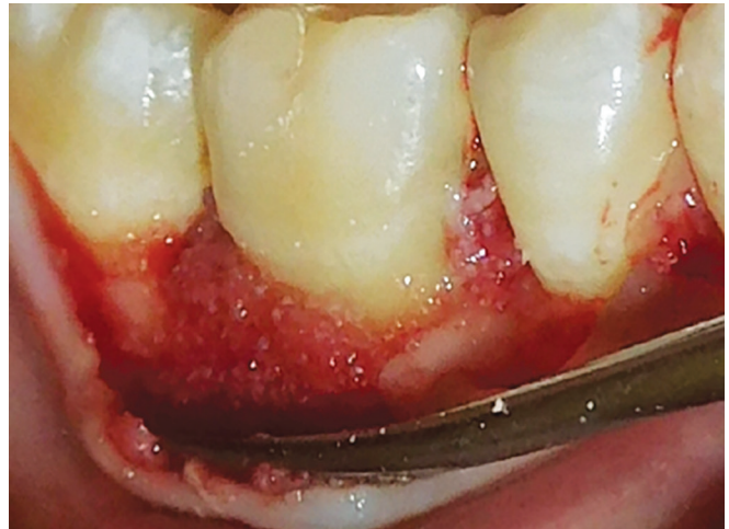
Fig. 2: Placement of bone graft material

After phase I therapy, 10 patients underwent periodontal flap surgery as described above. After complete debridement of